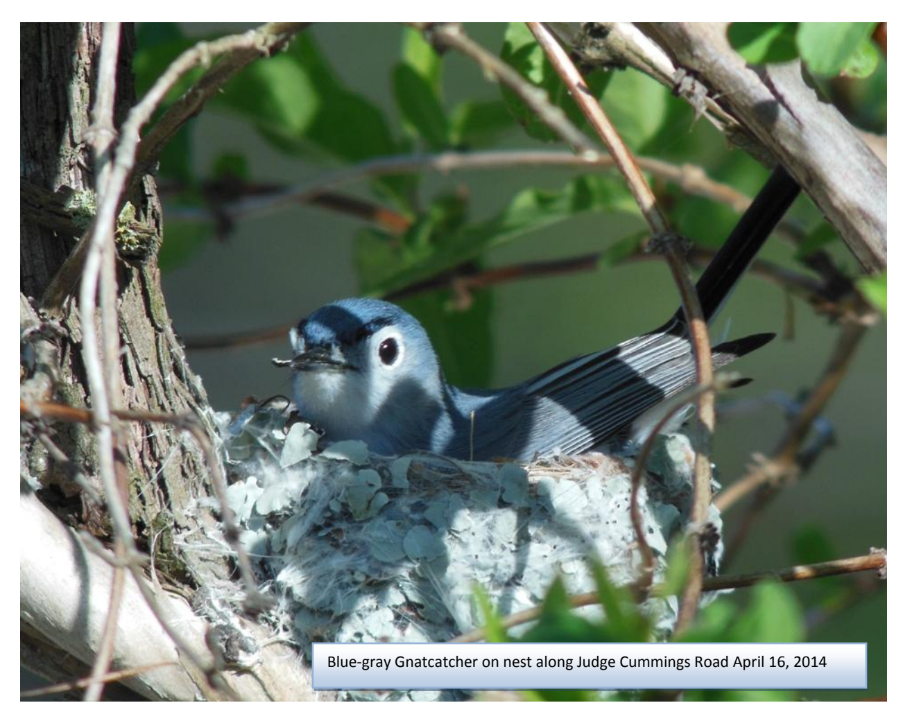
--Prepared by Joe Neal with editing by Doug James, June 2014

ON FOOT The trail system on Kessler as it exists in June 2014 was developed for mountain biking, but these trails are open for all other uses, too. It is possible to use them to walk a loop to include both the mountain top and forested slopes. A birding hike can include crossing the entire top of the mountain from the towers area in the south (off Kessler Mountain Road) through the upland forests of the park and exiting in the north at Rock City, which is private land, but currently open for limited public use. If time is limited, consider visiting Rock City, located on private land. You will need to sign a release form at the trailhead, but this just takes a minute or two, and the birding is always interesting. The regional park with its athletic fields is being developed off Judge Cummings Road. This is an excellent area to seek birds of pastures, hayfields and old fields with thickets and fencerows.